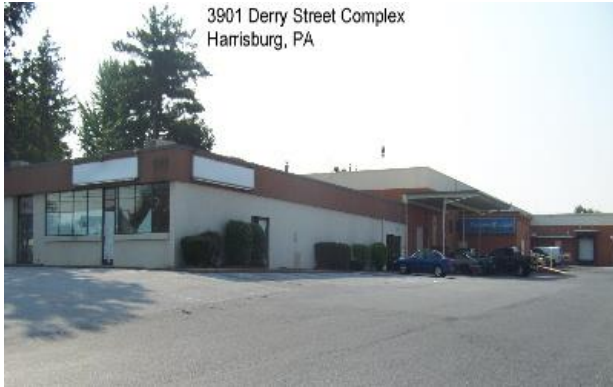
3901 Derry Street Complex Harrisburg, PA