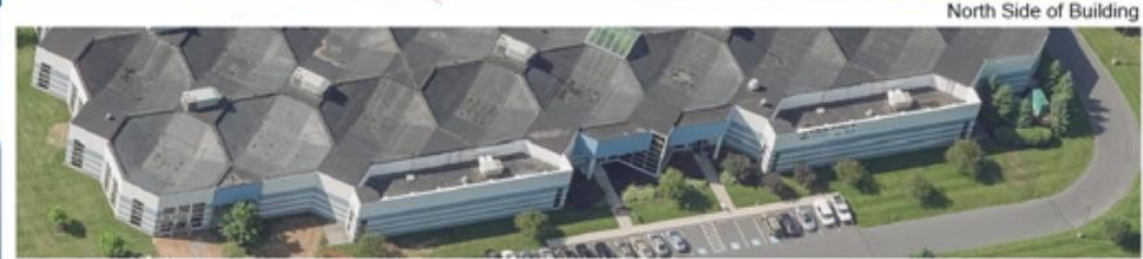
North Side of Building