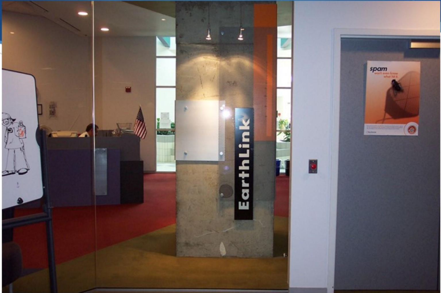
West Side Reception (former EarthLink)