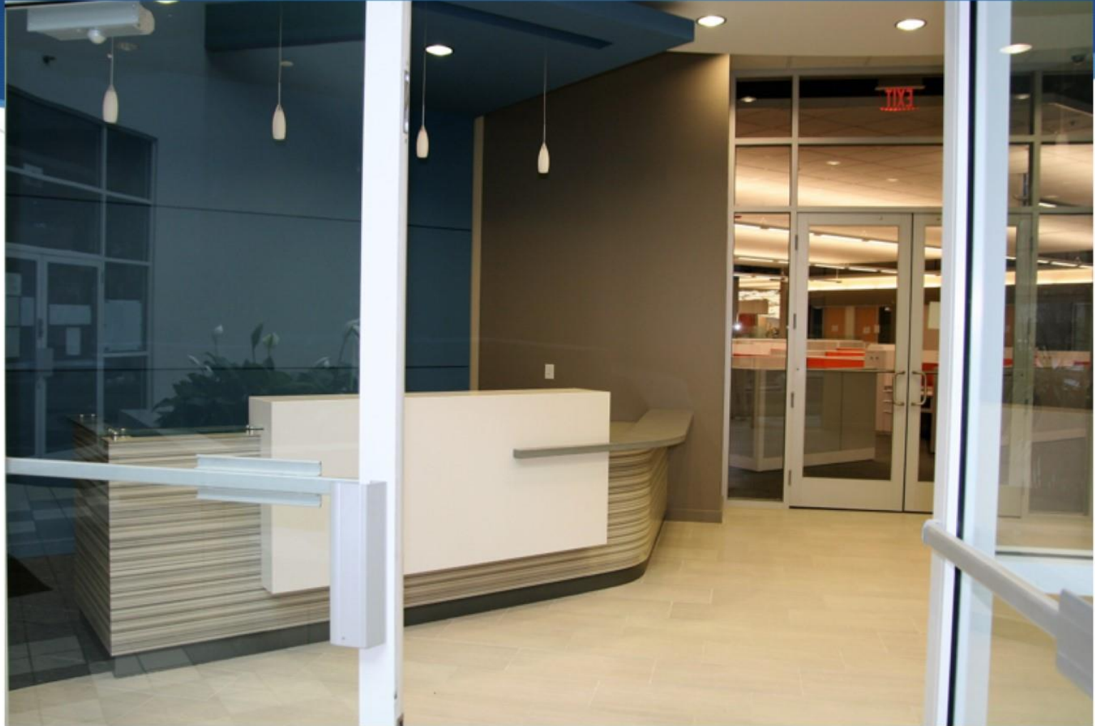
East Side Reception