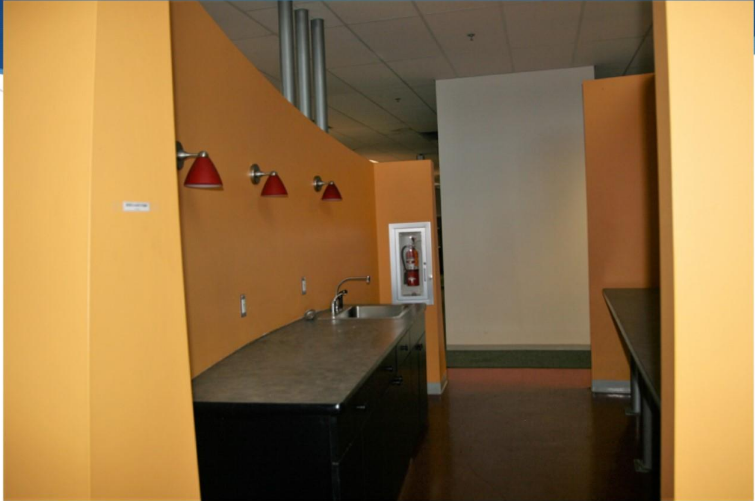
West Side Coffee Station