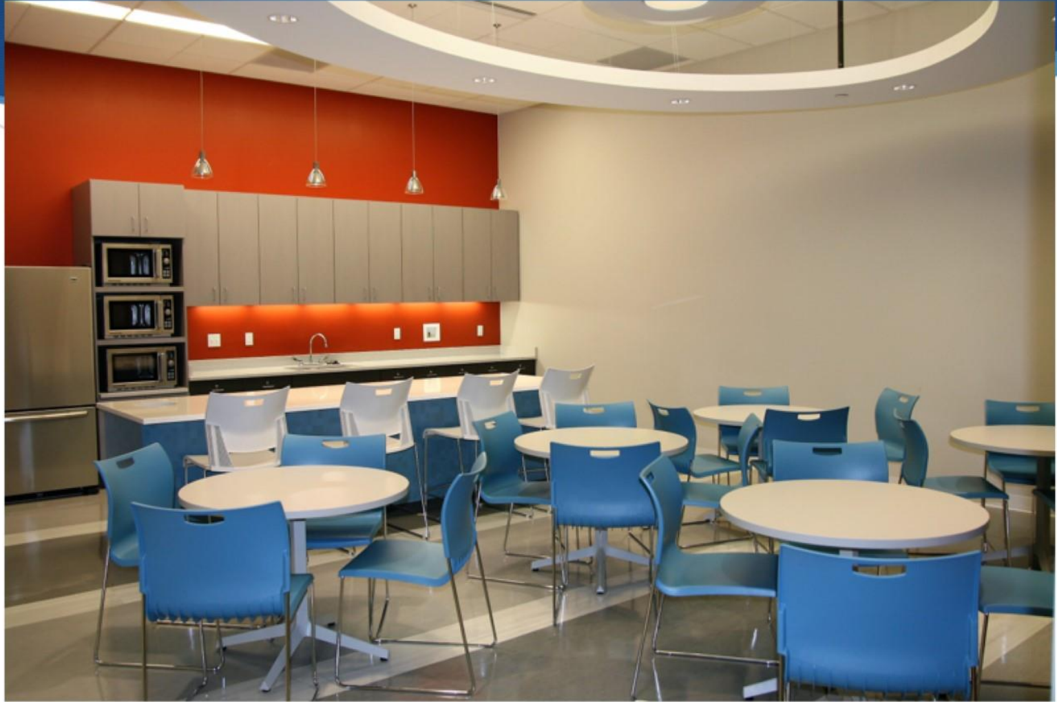
East Side Lounge