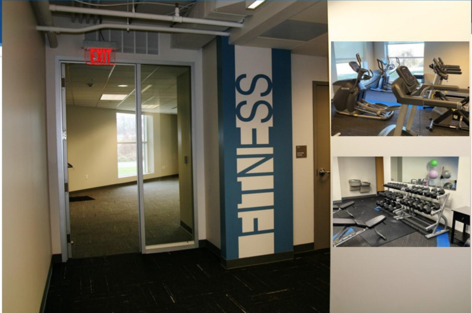
East Side Fitness Room