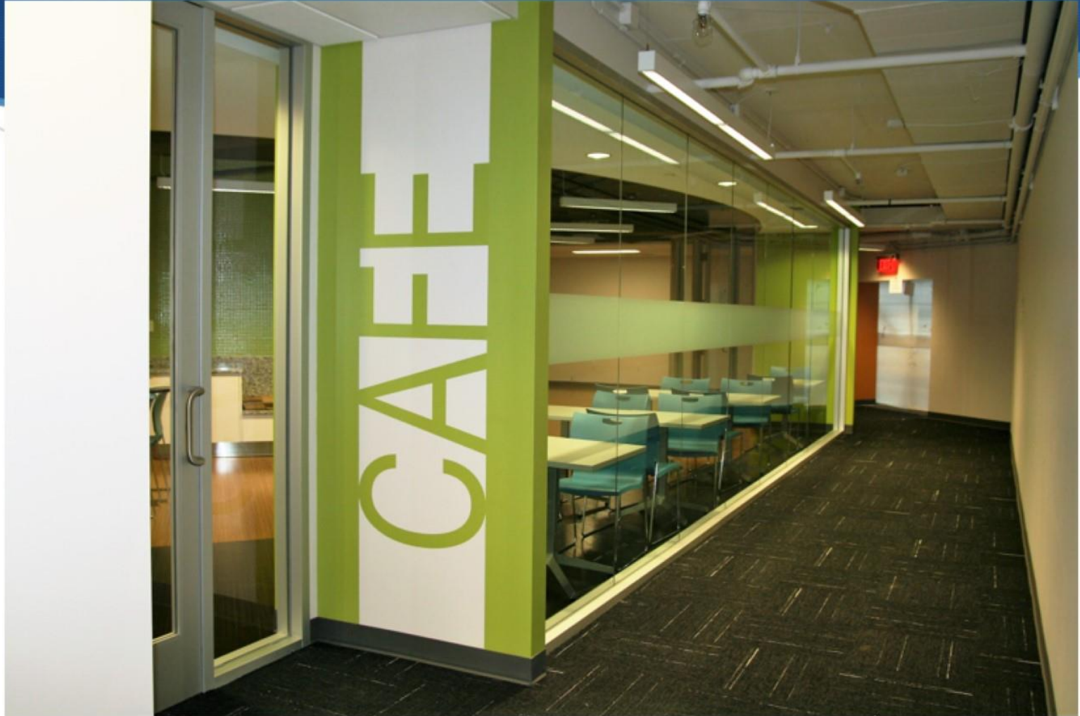
East Side Cafe