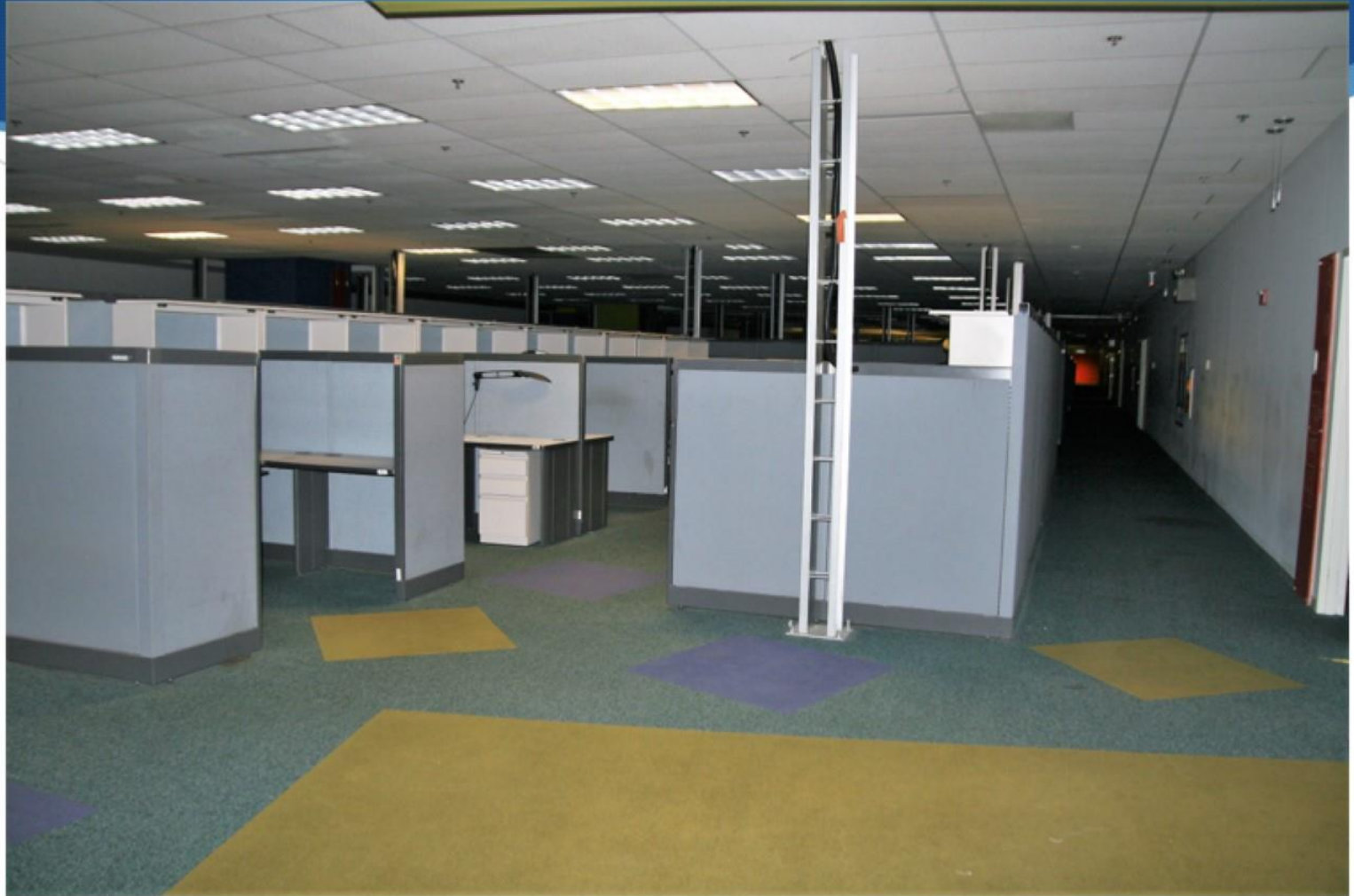
West Side Workstations