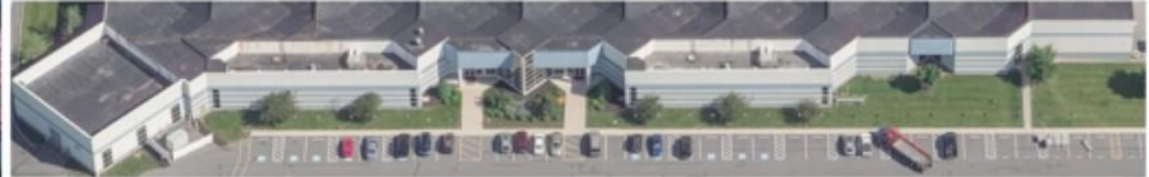
South Side of Building