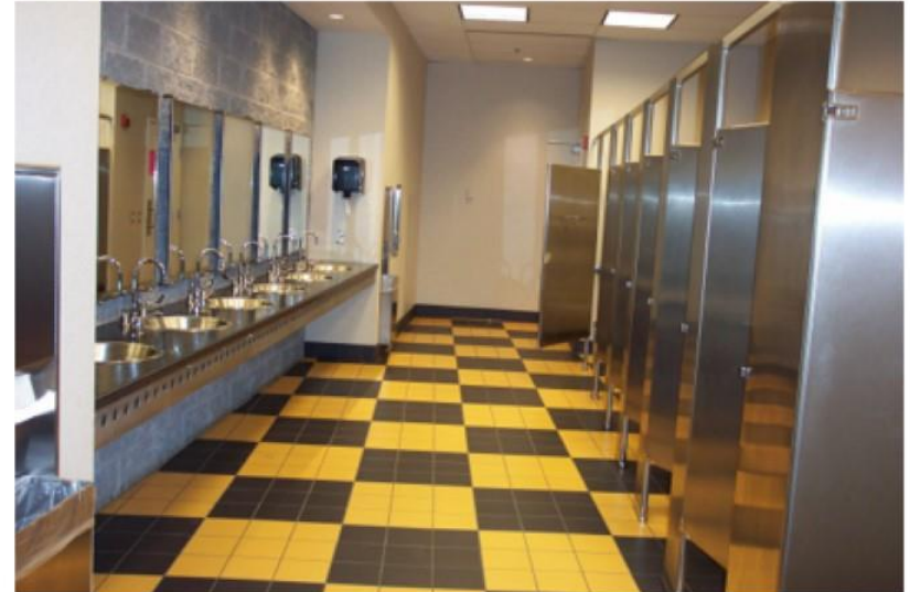
West Side Private Offices, Conference Rooms, Lounge, Bathroom