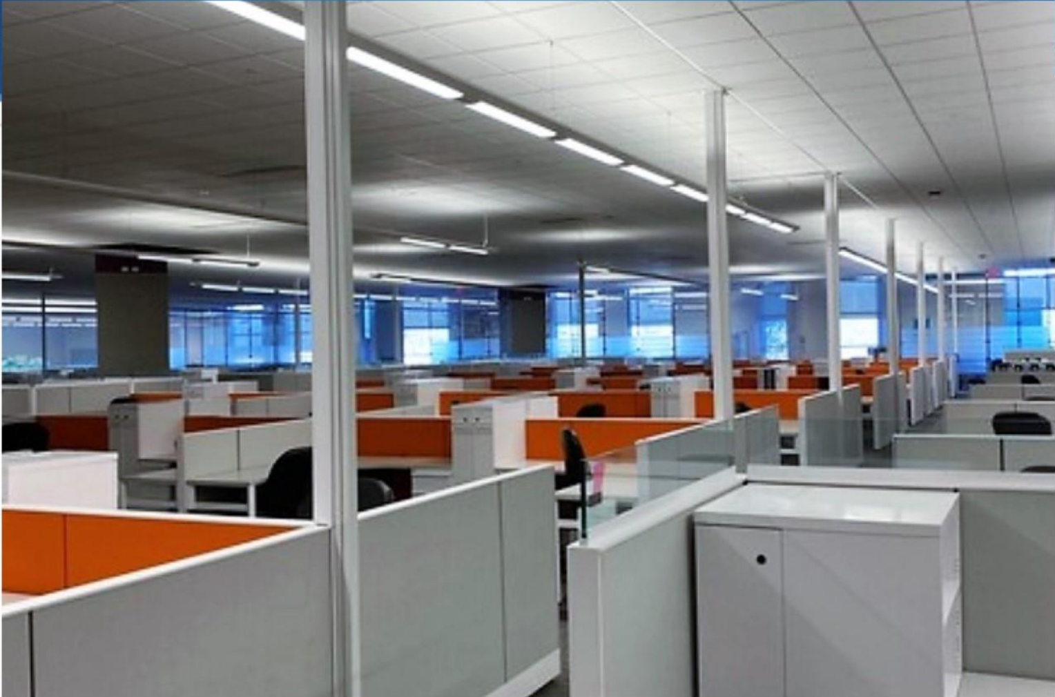
East Side Workstations