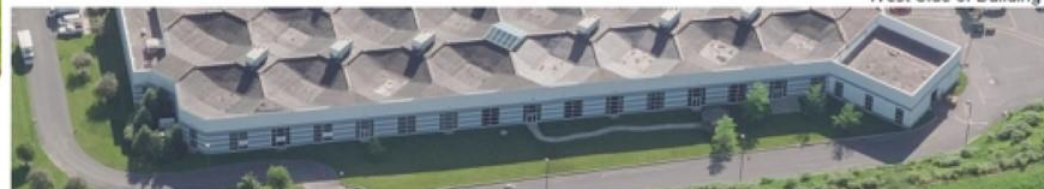
West Side of Building