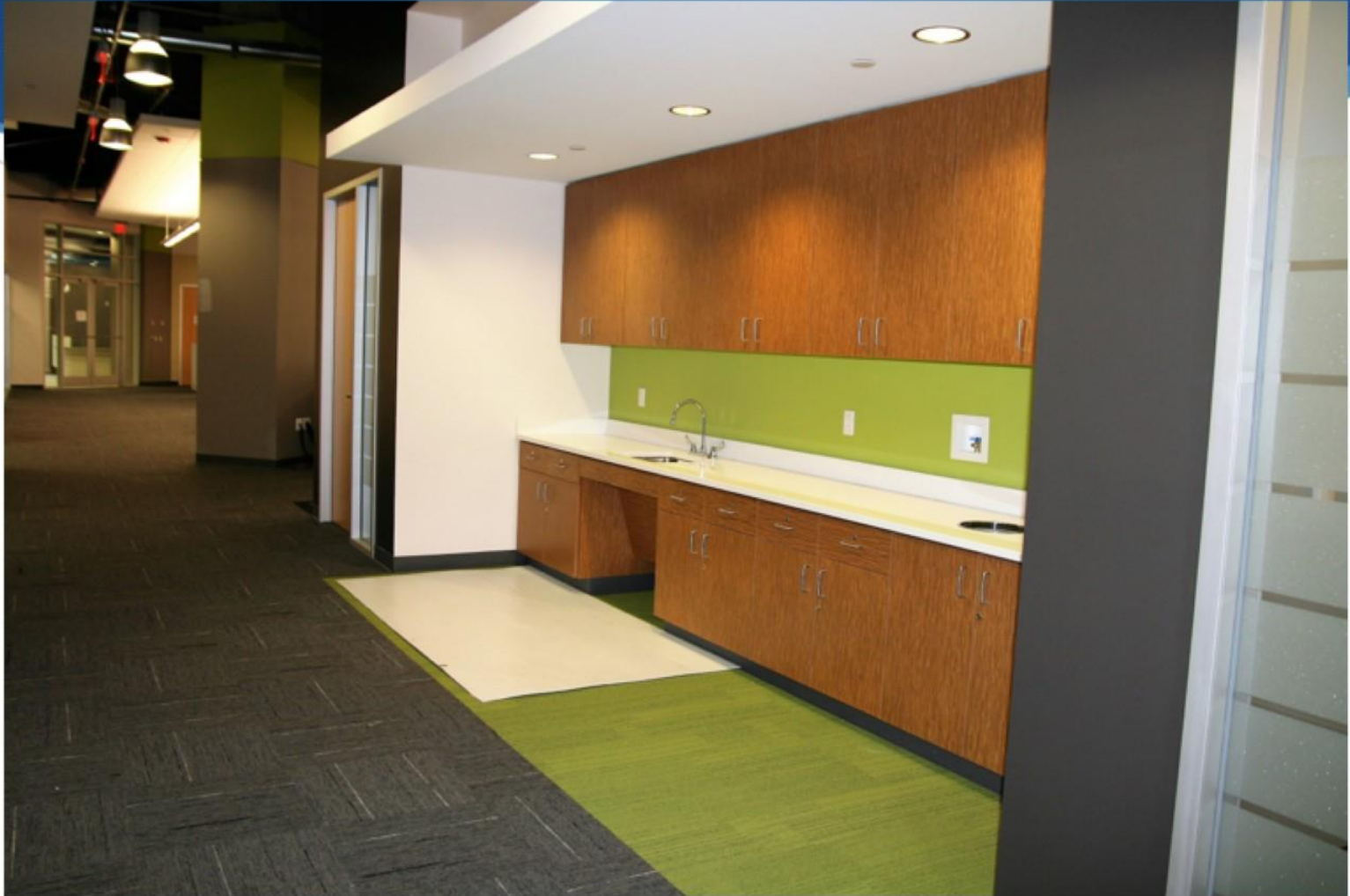
East Side Coffee Station