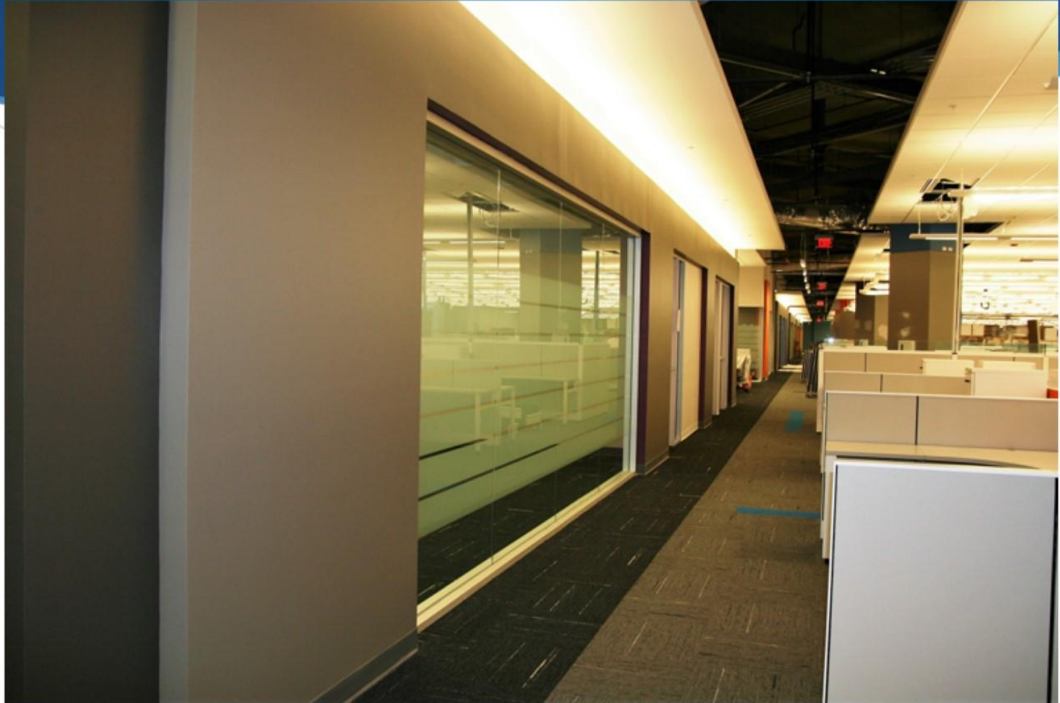
East Side Private Offices, Conference Rooms