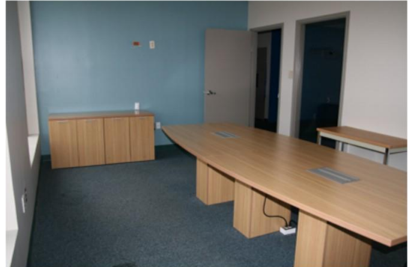
East Side 2 nd Floor Elevator Entrance, Private Offices, Workstations, Conference Room