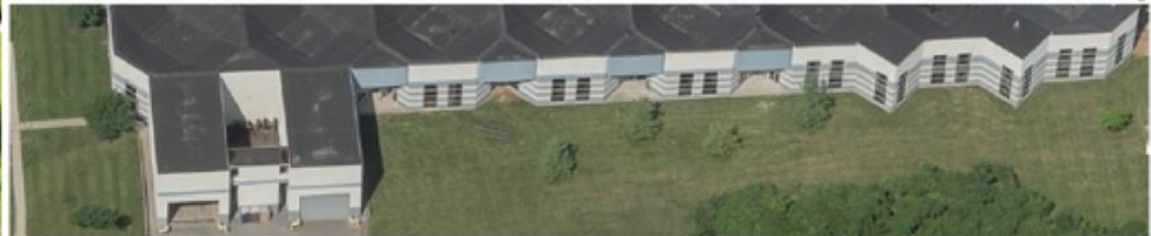
East Side of Building