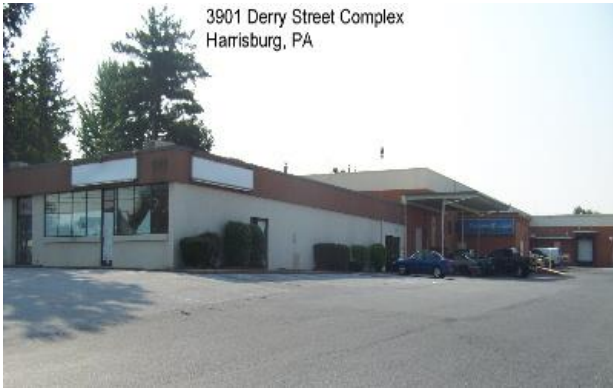
3901 Derry Street Complex Harrisburg, PA