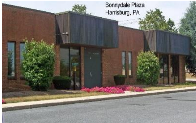
Bonnydale Plaza Harrisburg, PA